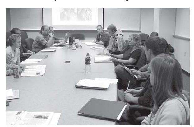
Dott-Pray-Clark Graduate Seminar Room ExxonMobil Alumni