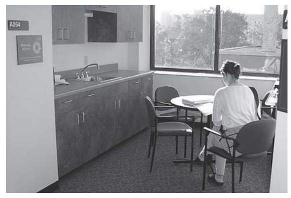
Second Floor Meeting Alcove BP